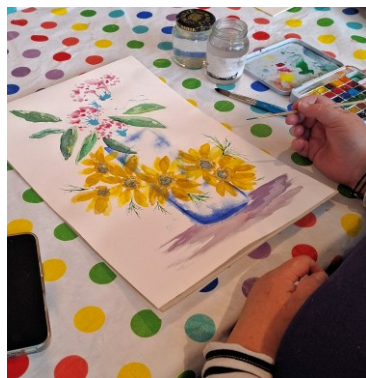
Yellow Daisies by Moira Doherty