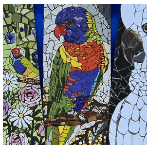
Bowden bird Walk news hero

A map showing the location of community street art is available on the council website.