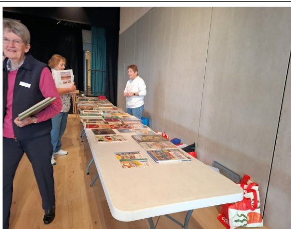
One Happy Customer from the Trading Table