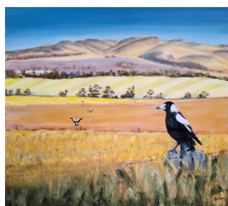
Clare Valley summer