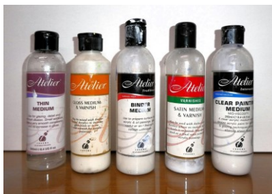
Mediums for Acrylic paint