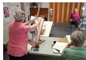
1 st Monday of Month.