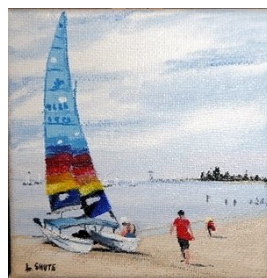
Minature of Seacliff Beach by Les Shute