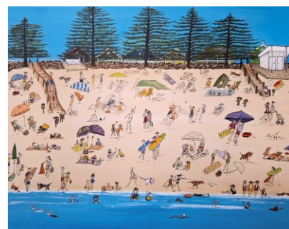
Popular: Beach People and their dogs by Pip Hanlon