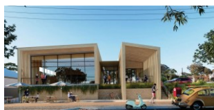
Artist's rendition of anticipated new hall