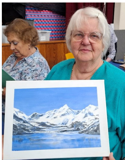
Snow-capped Mountains by Rosmarie Libiseller