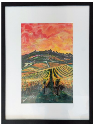
Piccadilly Vineyards