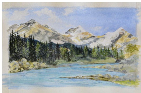
Alpine Scene in Watercolour by Rosmarie Libiseller