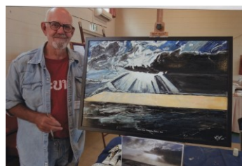
Storm Over Somerton Beach