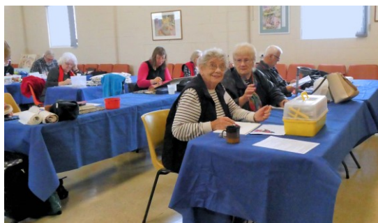
Borrowed from times past...Before Covid (BC)