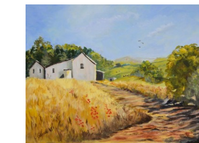
Ready for Exhibition—painting by Christine Creese