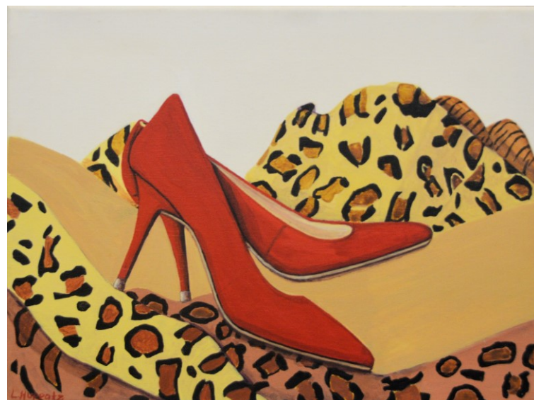
Fashion by Lynda Huppatz