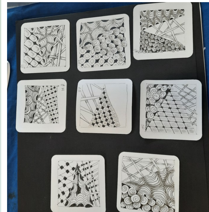
Tiles of Zentangles by Workshop Group