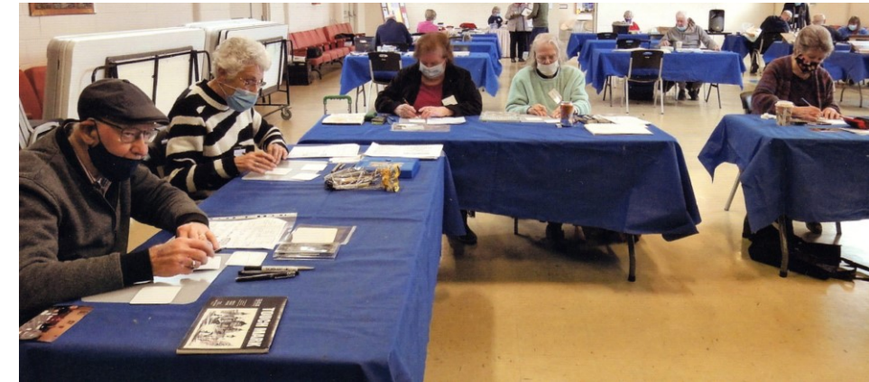
Group concentration on Zentangles