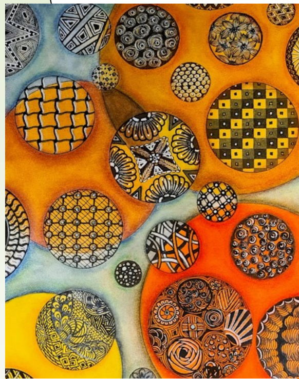
Zentangles patterns by Judith Hombsch