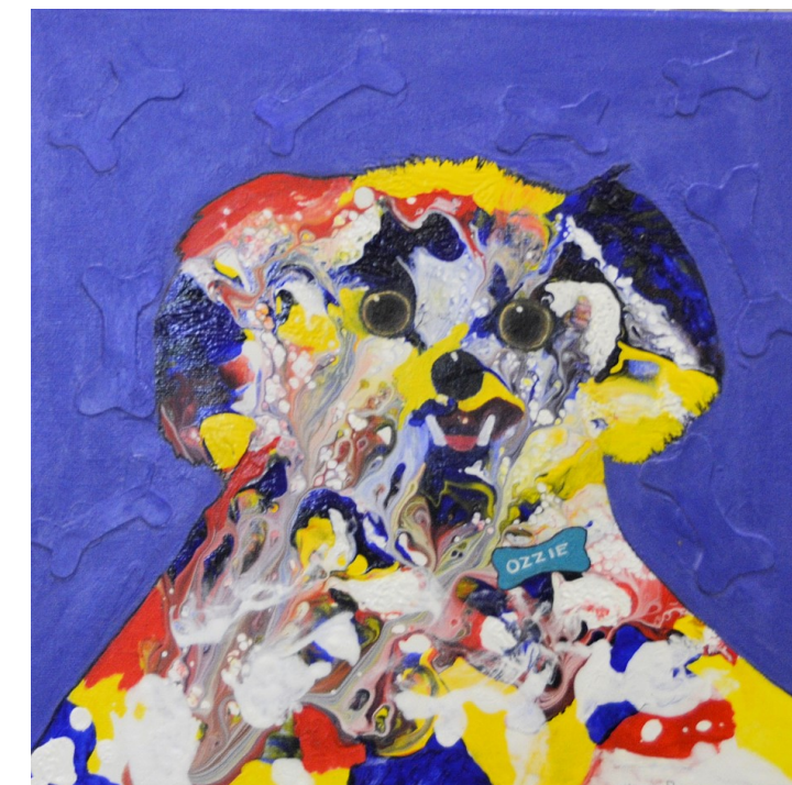
Fangs —a Pour Pooch by Henny Redden