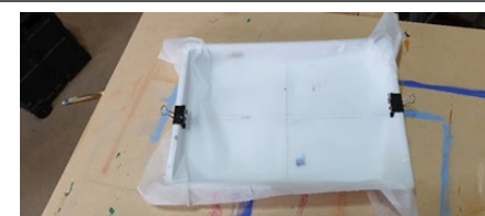
What a good idea—Baking paper