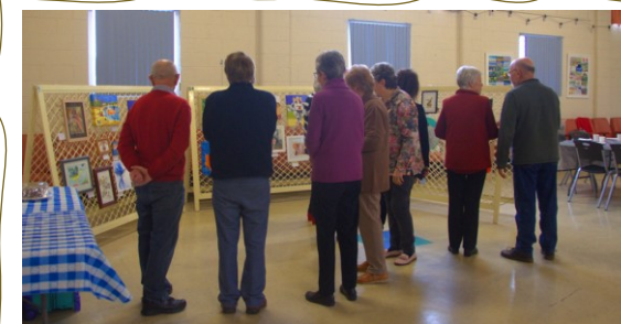
MAG's Mid-year Lunch—Admirers of the Display