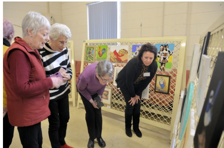
More Admirers of MAG Mid-year Lunch display