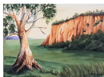
Overlooking Range by Lynne Wong

Continues to roll on providing beautiful artwork to contemplate while enjoying one's coffee.