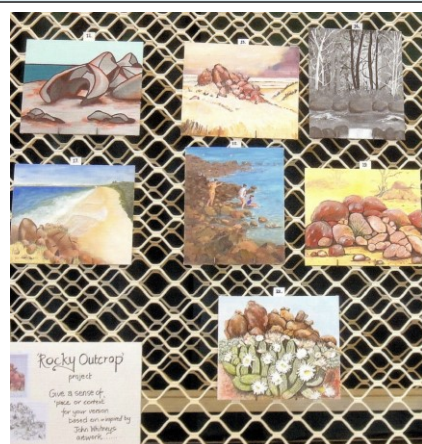
A portion of Potential Candidates for future exhibitions from the Rocky Outcrop Group Creative Project displayed at MAG's 2020 AGM and Christmas celebration.

(1) Marion Art Group —we usually have 2-3 exhibitions per year, and we set up for 1-2 weeks in local shopping centres. MAG pays the shopping centre for the space, provides the sales desk, and screens and organises transport of these to and from the shopping centre. Such shopping centre exhibitions are dependent on a space being available to rent. We rely on a member's roster to provide people to manage the sales desk. There are entry fees which allow members to rent screen space in either a full, half or quarter screen of your work, or members can submit one painting or multiple unframed artworks for a small fee. These exhibitions usually result in members selling their paintings and are our favourite platform for sales.