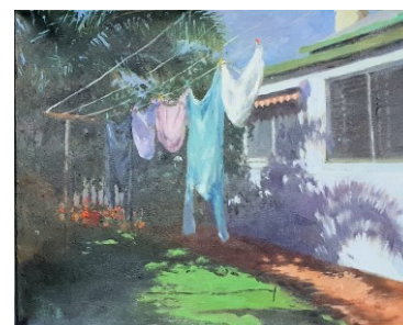
Shadow Play by Shirly Page