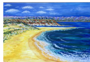
Port Noarlunga by Maryla Wawrzynski

(3) The Waterhouse Art Exhibition at the SA Museum—this is an open exhibition but has a selection process. Entry is $55 but the prizes are substantial too. Well worth a look at the web site.