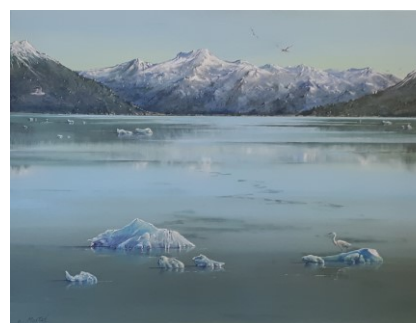
Cool Change from summer heat—Inarás Passage (Alaska) by Liz Maxted