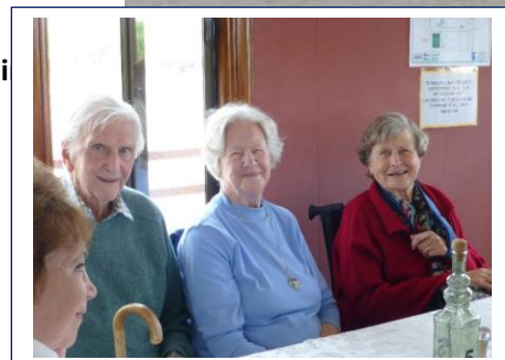
MAG members enjoying the Murray Cruise (left) and the views (above)